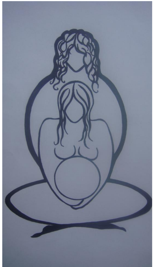
Drawing by Gwenhyfar Fowler